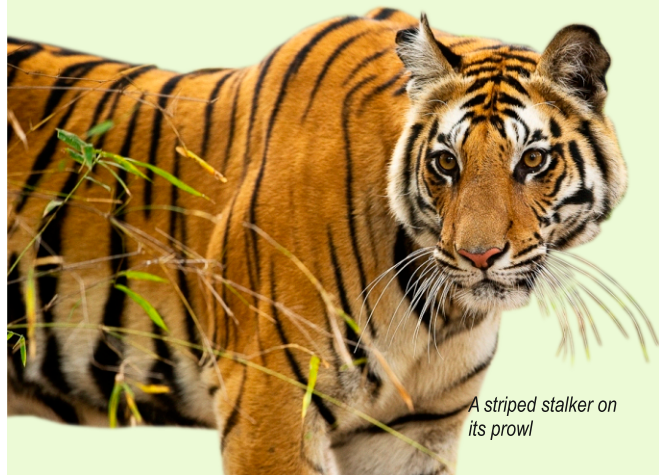
A striped stalker on its prowl

Panna National Park was created in 1981. It was declared as a Project Tiger Reserve in 1994. The National Park consists of areas from the former Gangau Wildlife Sanctuary created in 1975. The sanctuary comprised of territorial forests of the present North and South Panna