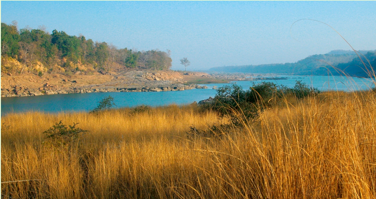
Scenic route of Ken River

P anna, the erstwhile capital of the Bundela kingdom, is famous for the Panna National Park. Panna town, the administrative headquarters of Panna District, is the hub of many religious monuments, which showcases the architectural marvels of Hindu and Islamic styles. Adorned with greenish meadows dotted with evergreen trees, undulating forests, hills and rocks, Panna serves as a perfect place for holiday tours and quite sojourn.