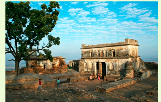
The historic fort of Ajaygarh

Fort of Ajaygarh- Built in 1765 AD by the nephew of the Maharaja of Jaitpur, the fort is situated at a height of 800 ft. However, by 1809 the Britishers overpowered it.