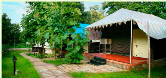
Jungle Camp Madla ( Panna)