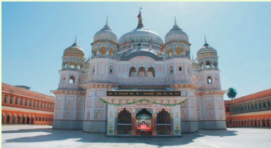
Mahamati Prannathji Mandir

Mahamati Prannathji Mandir - It is one of the most revered pilgrim places for the Pranami sect followers the world over. The temple was completed in 1692. Other than this Padmavati temple, Baldevji temple, Jugal Kishore temple, Gatha falls and Kalinjir fort are worth a visit.